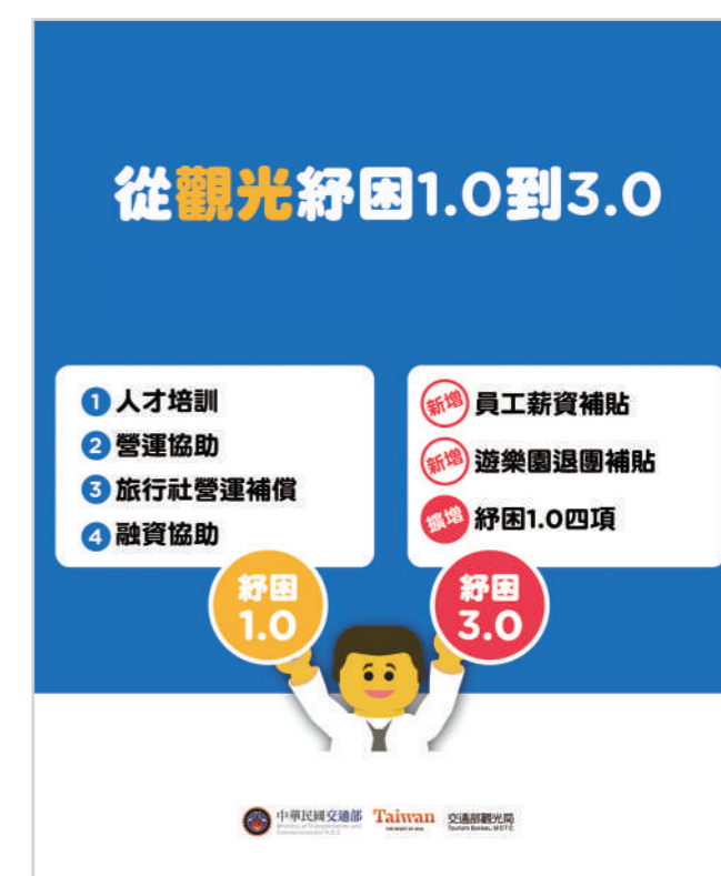
從觀光紓困 1.0 到 3.0 Tourism relief: From 1.0 to 3.0

Stimulus measures were launched to boost domestic travel, including group travel discounts, hotel discounts for independent travelers, amusement park admission discounts, Taiwan Tour Bus discounts for independent travel, and subsidies for local governments to arrange unique local events. As of December 31, 2020, a total of NT$7.613 billion had been allocated for such measures. The "Safe Travels" program, implemented from July to October of 2020, incentivized 18.46 million trips, boosting domestic tourism demand and generating tourism benefits of NT$65.4 billion. It also contributed to a 4.26% rise in the economic growth rate in the third quarter of 2020, and a 3.12% rise in the annual economic growth rate.