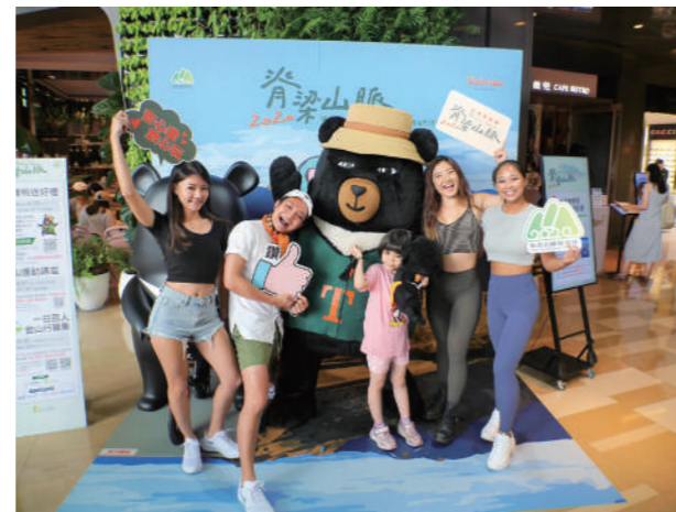
2020 臺灣金美脈 脊梁山脈攝影展 2020 Taiwan Beautiful Mountain Ridge Photography Exhibition

The Tourism Bureau assisted 21 county and city governments and nine national scenic area administrations in the development of 60 Taiwan Tourist Shuttle routes (including 47 accessible routes). These routes attracted nearly 3.72 million riders and provided independent domestic and foreign travelers direct and friendly round-trip shuttle services between major public transportation hubs and well-known scenic attractions.