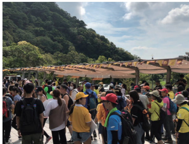
跟著喔熊上山去硬漢嶺登山活動 Following OhBear to Yinghan Peak on a hiking activity

輔導 21 個縣市政府及 9 個國家風景區管理處，開行 60 條台灣好行路線 ( 含 47 條無障礙路線 )，吸引近 372 萬人次搭乘，提供國內外自由旅客往返主要大眾運輸場站及知名景點間直接、友善的景點接駁服務。